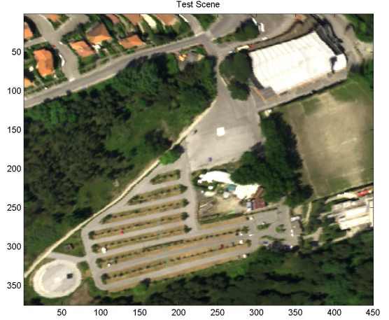
Fig. 1. Complete RGB view of the Viareggio test scene

In order to assess the performance of each GLRT derived in this paper (and hence the validity of the different assumptions), we propose to test them against real hyperspectral data. More precisely, we consider the Viareggio 2013 airborne trial [12]. This benchmarking hyperspectral detection campaign took place in Viareggio (Italy), in May 2013, with an aircraft flying at 1200 meters. The open data consist of three [450 \times 375] pixels maps composed of 511 samples in the Visible Near InfraRed (VINR) band (400–1000nm). The spatial resolution of the image is about 0.6 meters. Different kinds of vehicles as well as coloured panels served as known targets. For each of these targets, a spectral signature obtained from ground spectroradiometer measurements is available. Moreover, a black and a white cover, serving as calibration targets, were also deployed. As can be seen on Fig. 1, the scene is composed