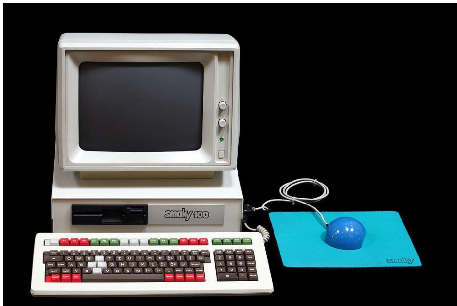
Figure 1. The Smaky 100.