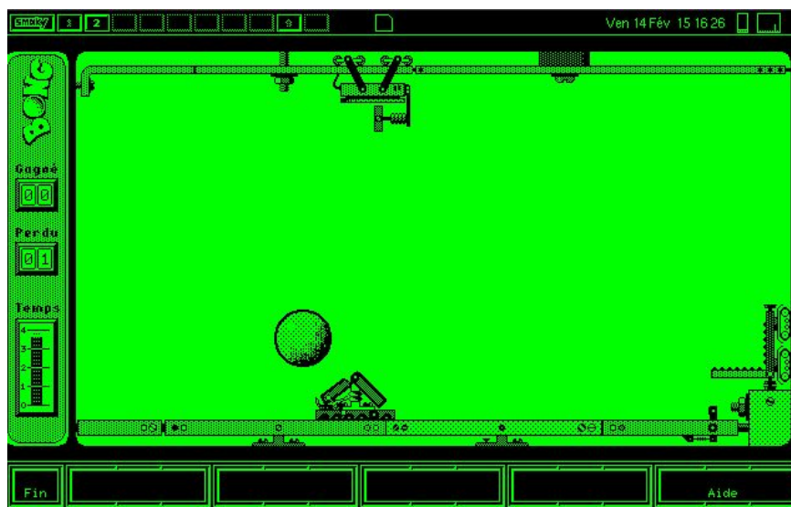
Fig. 2: Screenshots of the racket after the call of function ENDRAQ (for “end racket”), Bong (Daniel Roux 1987)

Both source codes are in assembly language. As computers only understand binaries which are composed of 0 and 1, assembly language is the lowest level language (i.e. with the highest correspondence to the machine code) still readable by a human being. It means that assembly language is relative to a platform architecture, and that the source code is harder to understand than high-level language such as C#. Fortunately, Bong source code is heavily commented, which is a two-fold opportunity: those comments will facilitate our understanding of the code inner-workings and they are in themselves a very important material to analyse.