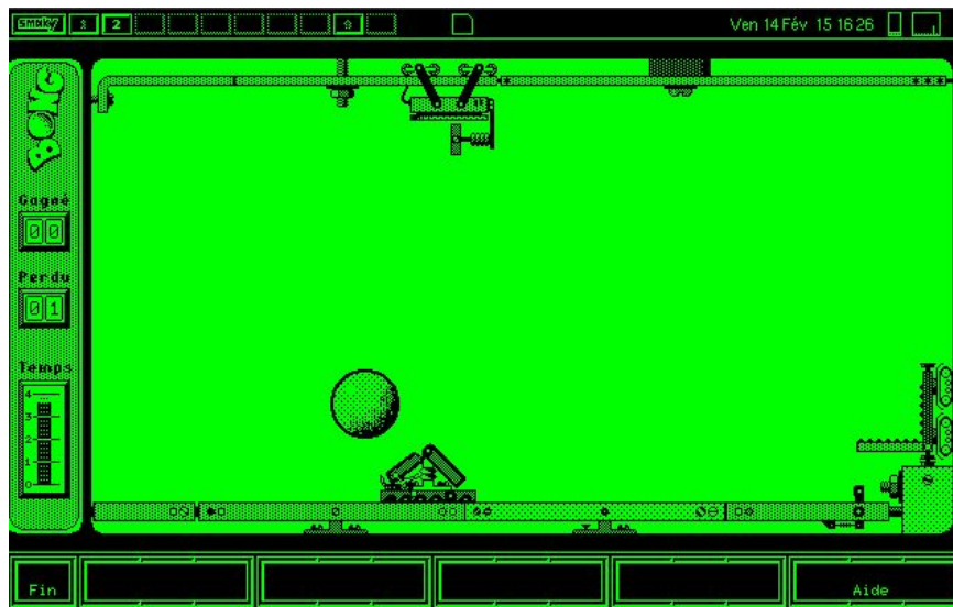
Fig. 2: Screenshots of the racket after the call of function ENDRAQ (for “end racket”), Bong (Daniel Roux 1987)

Both source codes are in assembly language. As computers only understand binaries which are composed of 0 and 1, assembly language is the lowest level language (i.e. with the highest correspondence to the machine code) still readable by a human being. It means that assembly language is relative to a platform architecture, and that the source code is harder to understand than high-level language such as C#. Fortunately, Bong source code is heavily commented, which is a two-fold opportunity: those comments will facilitate our understanding of the code inner-workings and they are in themselves a very important material to analyse.