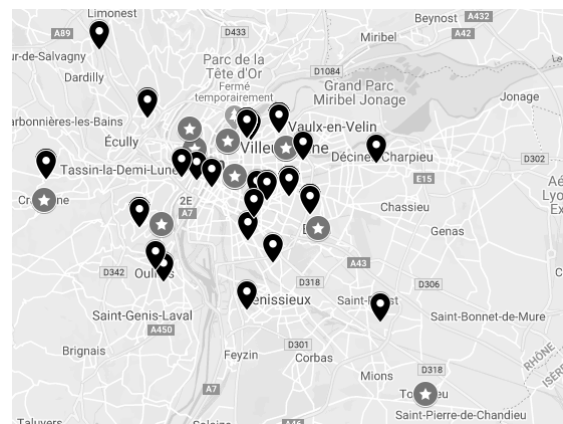
Figure 1 – Zoomed-in overview of our case study without the two most distant patients

In Figure 1, we can see the disparity and complexity of employee and patient locations. In this example we have 12 SLTs (grey stars) and 100 patients (black markers). When the locations are the same, only one point is shown on the map, which explains why the number of points is lower than the total number of patients.