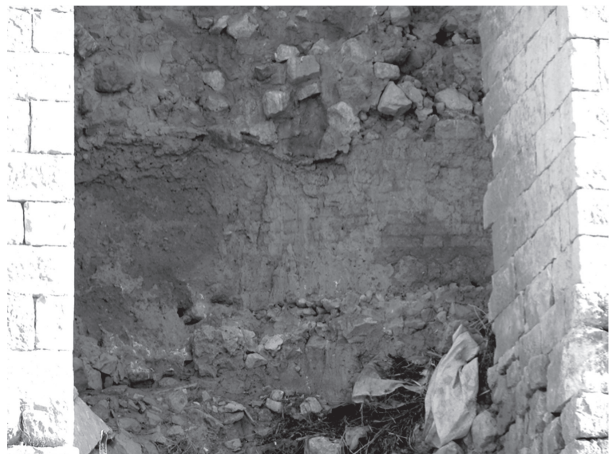
Figure 4: Sector C. The archaeological layers behind the pillars of the Medieval buttress show a thick mudbrick wall, a probable continuation of the Bronze Age (?) rampart. View to the north.