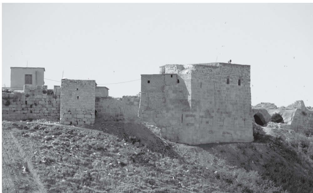
Figure 6: The tower 5 after restoration, with the two curtains consolidated. View to the northwest. (© Archaeological Mission of Qalaat Al-Mudiq-Citadel of Apamea).