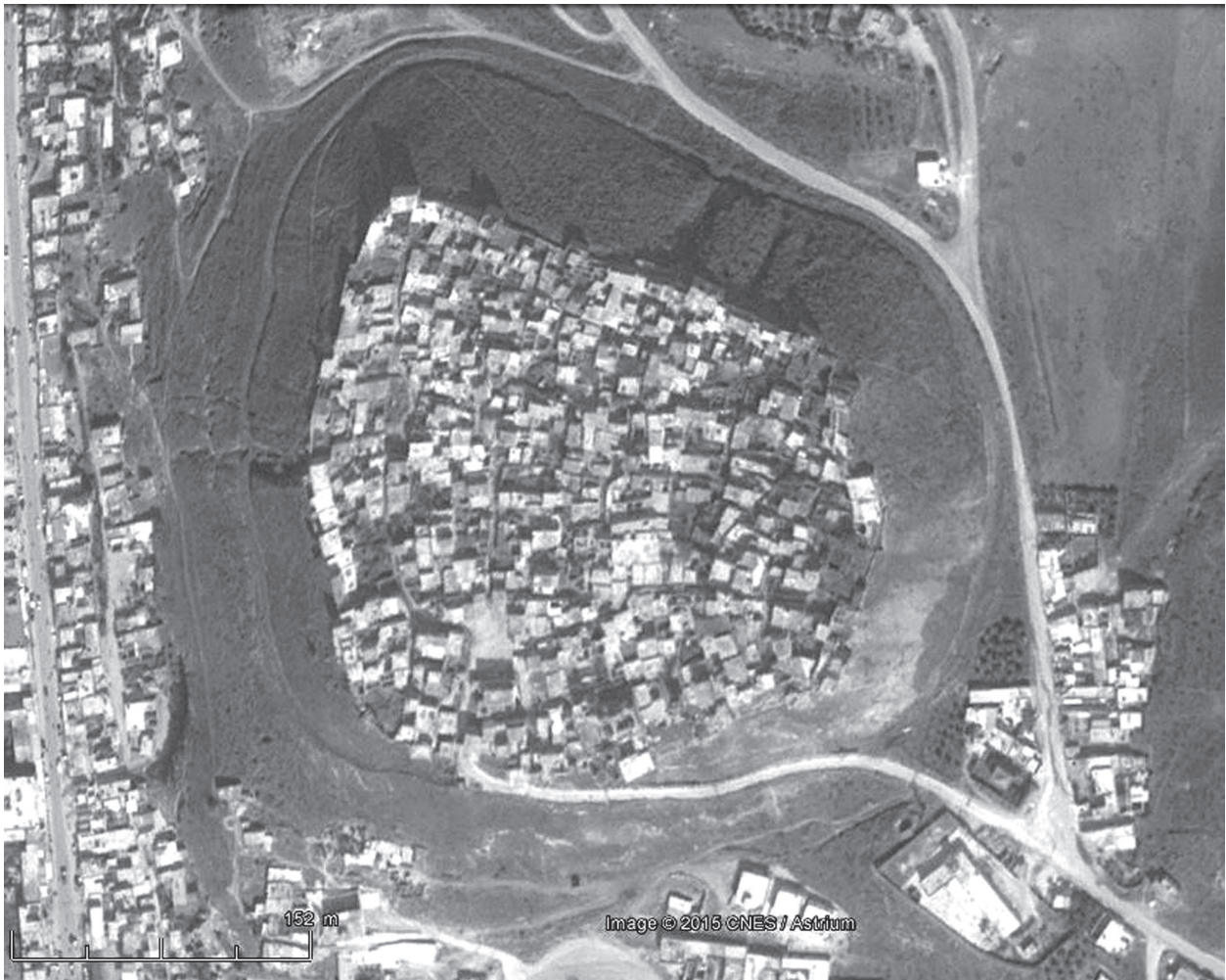
Figure 7: Aerial view of the tell in 2015. The road surrounding it has pierced the stone glacis and the earthen fill. The north is on the top.