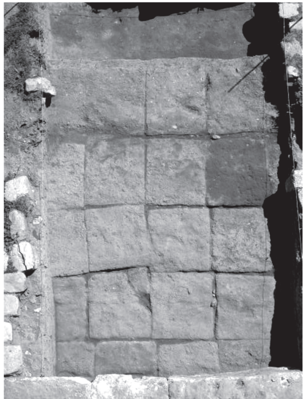
Figure 3: Sector A. Vertical view of the mudbrick rampart probably from the Bronze Age; the north is down (© Archaeological Mission of Qalaat Al-Mudiq-Citadel of Apamea).

wall, 3 m long and 1.70 m high, made of mudbricks (Figure 3). Its western continuation was found in the slope and it is also visible to the east, behind the pillars of the medieval buttress located between sector B and the medieval gate (Figure 4). In this sector C, the erosion of the soils was very active at the top of the slope and exposed this wall. In both sectors A and C, the wall was located exactly at the edge of the slope. If vestiges of this wall from sectors A, B, and C can be associated together, the wall would be at least 92 m long and would constitute a fortification wall (Gelin 2013). However, even though many ceramic sherds from the