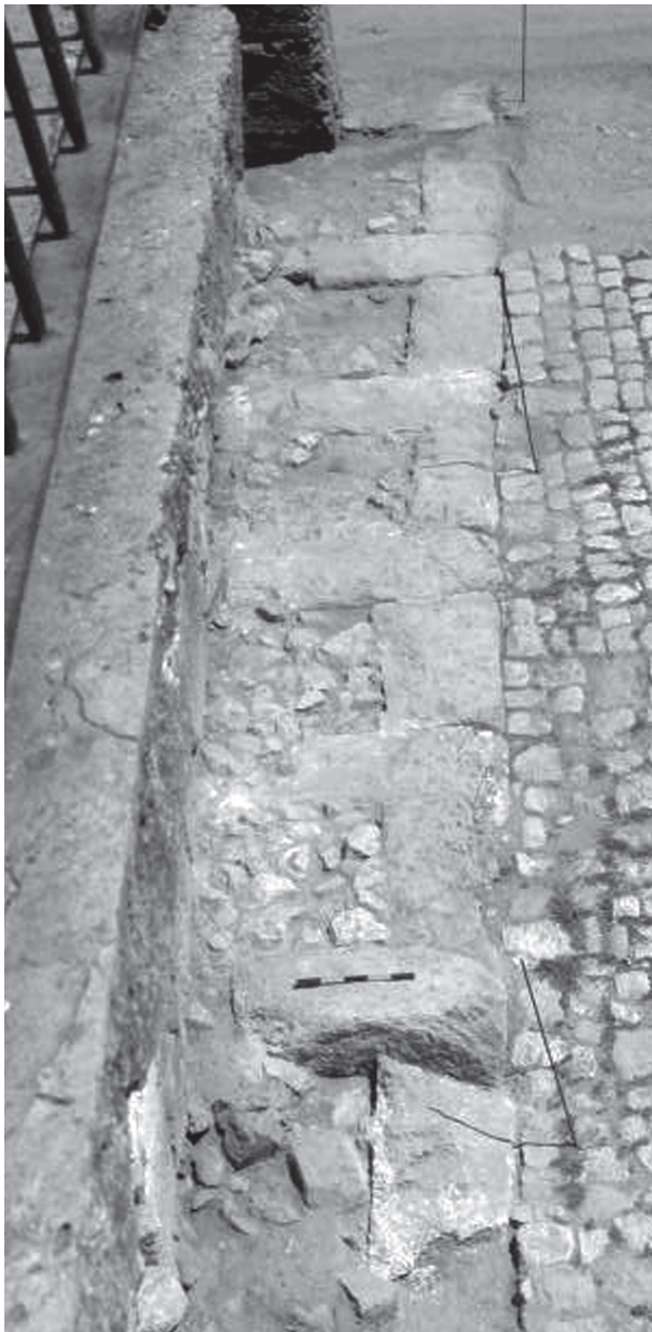
Figure 2: Sector A. The Hellenistic stone wall (on the left, modern dwelling; on the right, white stones of a modern stair), view to the east.

wall, 3 m long and 1.70 m high, made of mudbricks (Figure 3). Its western continuation was found in the slope and it is also visible to the east, behind the pillars of the medieval buttress located between sector B and the medieval gate (Figure 4). In this sector C, the erosion of the soils was very active at the top of the slope and exposed this wall. In both sectors A and C, the wall was located exactly at the edge of the slope. If vestiges of this wall from sectors A, B, and C can be associated together, the wall would be at least 92 m long and would constitute a fortification wall (Gelin 2013). However, even though many ceramic sherds from the