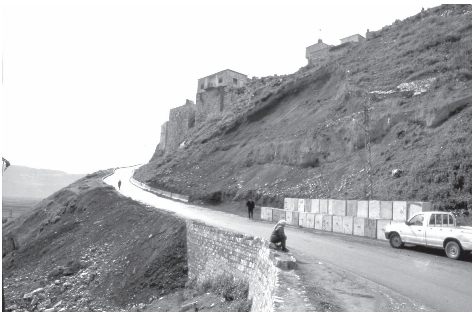
Figure 8: The previous road cut in the 1920s and recently enlarged, which caused the collapse of the glacis and soils of the tell. View to the northwest.