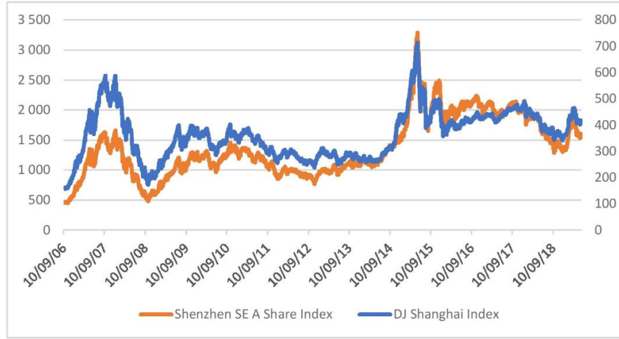
Fig. 1. Price for DJ Shanghai Index and Shenzhen A Share Index in USD 2006 – 2019.

Figure 1 shows the price series for the Shenzhen and the Shanghai Indexes, the requisite data is obtained from the Factset database.