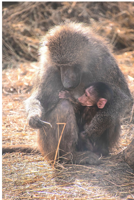
Figure 1. Maternal cradling in an adult female olive baboon. A baboon mother is cradling her baby on her left side.

On the other hand, right-side cradling is associated with higher pre- and postnatal maternal anxiety and depression 24,25 . Maternal depression involves decreased communication within the mother-infant dyad 26 and a dysfunction of the right brain hemisphere affecting emotional perception. It may therefore be considered as a factor that alters the left-cradling bias 27 . Other studies have found higher stress levels in mothers with a right-cradling bias, than in their counterparts cradling on the left 28 . Stress can immediately impact the infant cradling: under induced physiological stress conditions (identified by a higher blood pressure and heart rate), women hold a human-like doll more on the right 29 . In both 4 and 5-year-old boys and girls, the left-cradling bias is already strongly present when cradling a human infant-like doll, but can be reversed under unfamiliar or stressful stimuli 5 . Affective symptoms can therefore alter left cradling, reflecting a reduced ability to be emotionally involved with the infant.