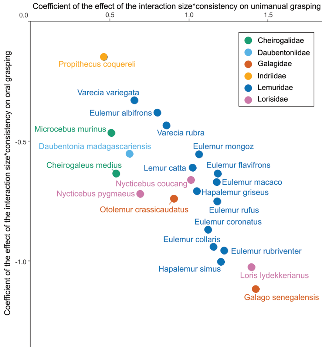
Figure 3. Coefficients of the generalized linear mixed models of the effect of the interaction between food item size and consistency on oral and unimanual grasping behaviours for each species ( N = 22 species). Colours represent the six extant families of strepsirrhines included in the study.

tested for big items only ( \beta = 0.96 \pm 0.33 ; P = 0.004 ; Table 3, M5.1; and \beta = -0.91 \pm 0.30 ; P = 0.002 ; Table 4, UM4.1, respectively), but not for small items only (Table 3, M5.2; and Table 4, UM4.2). These effects were also present when tested only on the individuals that had been observed in both height conditions ( \beta = 1.08 \pm 0.29 ; P < 0.001 ; Table 3, M5.4; and \beta = -0.93 \pm 0.25 ; P < 0.001 ; Table 4, UM4.4, respectively).