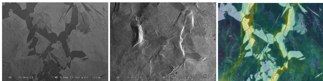
(b) SEM image of ROI before tensile testing (c) SEM image of ROI after tensile testing (d) Zoomed strain field ( \epsilon_{vm} ) on ROI