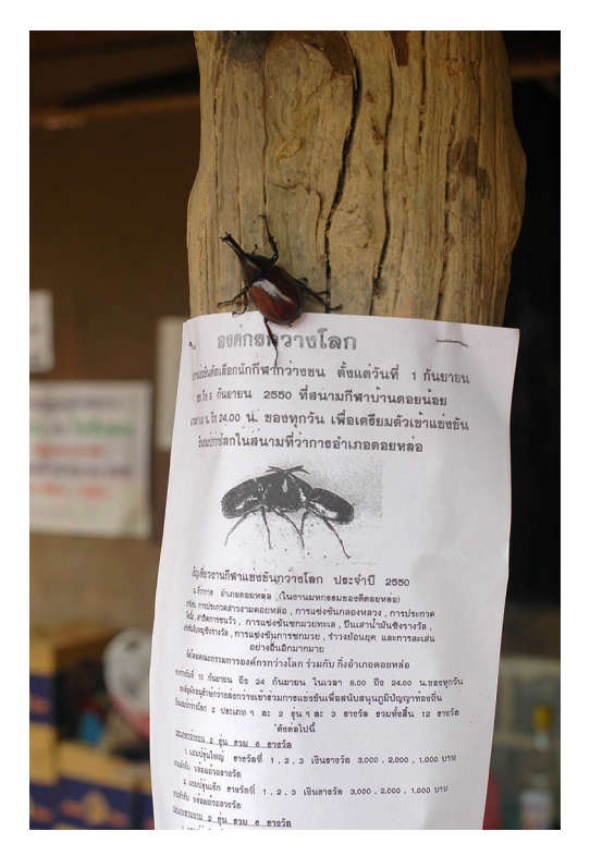
Fig. 1 An Advertisement for a Competition That Met Someone's Interest (Stéphane Rennesson)

bugs alongside stag beetles, for example. However, from the information gathered on the subject, it is only in Northern Thailand that the human–coleoptera relationship has reached such a level of refinement and institutionalization.