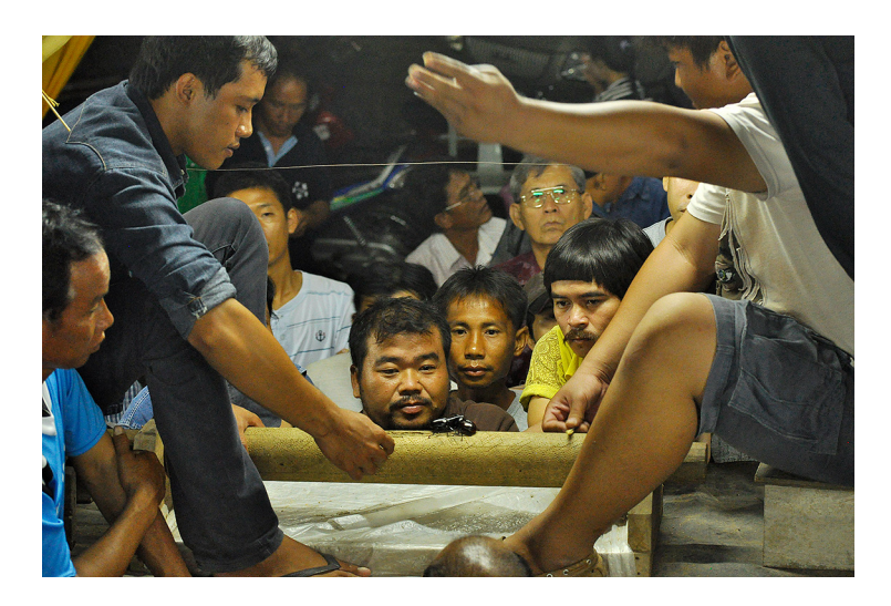
Fig. 5 A Players Calls for a Bet. He Feels Confident as the Fight Is Gaining Momentum (Stéphane Rennesson).

in the whole circuit of communication linking players with their beetles and all the technical apparatus, different ontologies of the kwaang do also flourish among players. Interestingly, when it comes to interpreting the results of such fights, the ponderation in between natural characteristics (either genetics and or morphology), psychology, training, player's technicity on the log, and so on, vary a lot from one player to another.