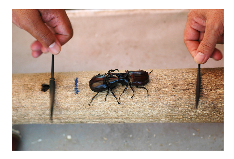
Fig. 4 Both Players Are Rolling Their Stylus to Send Vibrations to Their Beetles (Stéphane Rennesson).

that allows them to extend the fight, which can last as long as 20 or even 30 minutes.