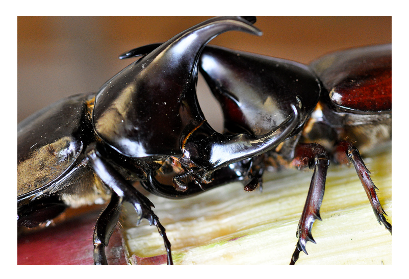
Fig. 3 The Beetles Are Now Engaging in a Real Balance of Power (Stéphane Rennesson).

presumed aggressiveness linked to their obsession to breed, rhinoceros beetle males are also regarded as highly sensible animals, mostly to vibrations. In fact, the players try to communicate with their beetles, thanks to a "notched stylus" (mai phan, "linku) that when properly manipulated can produce vibrations that the insects seem to be interested in. By doing so, the players follow a well-documented ability of vibratory communication among arthropods. Beetles, notably, can produce various kinds of stridulation depending on the different species (by scraping their protothorax against their mesothorax, in the case of the rhinoceros beetle).