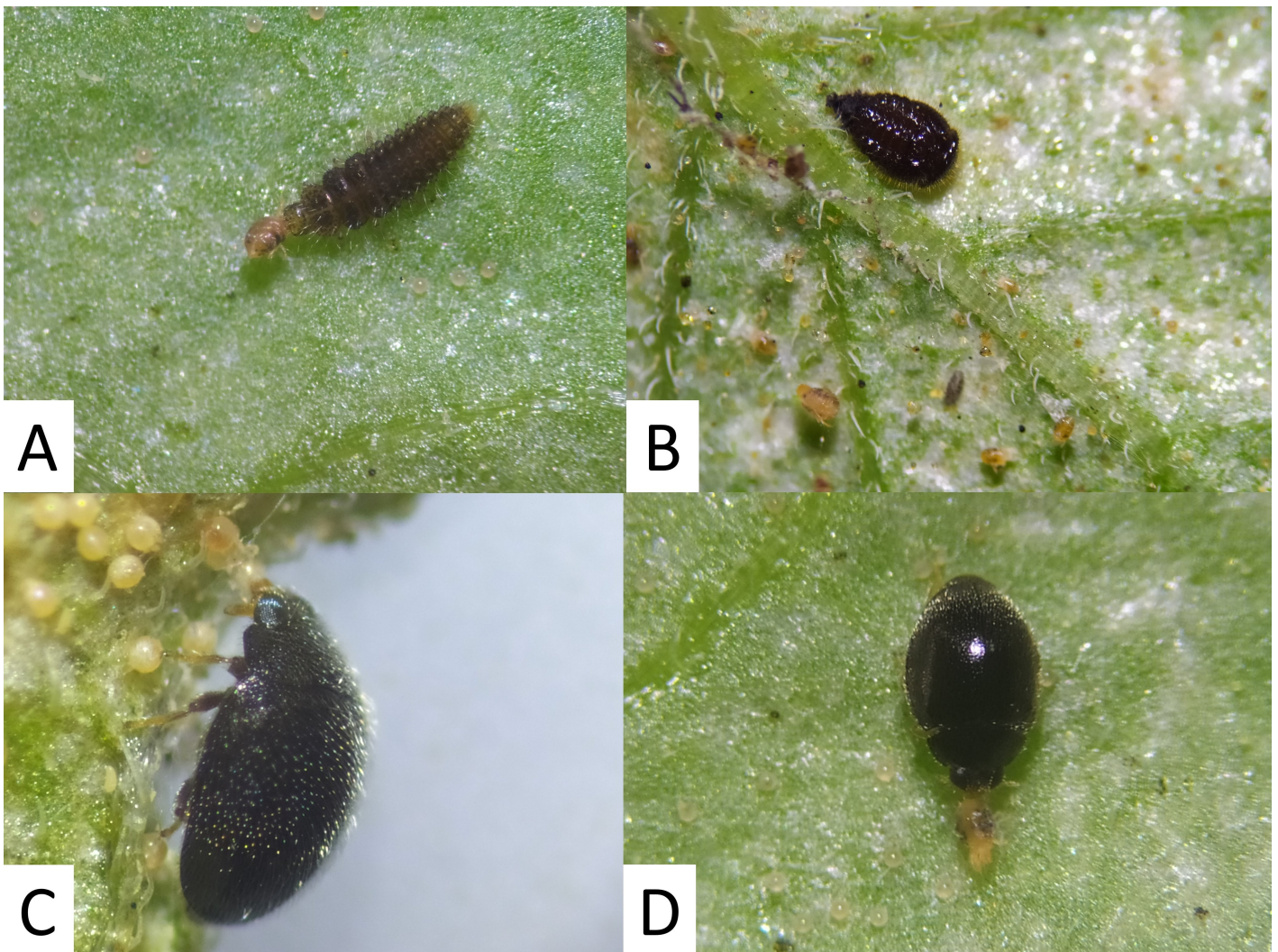
Figure 1 Life stages of Stethorus gilvifrons feeding on all developmental stages of Tetranychus evansi : A – Larva feeding on adult; B – Pupa; C – Adult feeding on eggs; D – Adult feeding on nymph.

Two species of predatory insects were identified from the colonies of T. evansi .