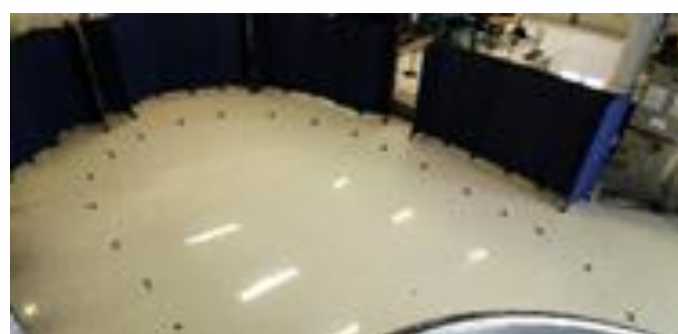
Figure 1: Walking path

Changes in DLPFC activation and improvement of walking performance are expected after the Sirocco program