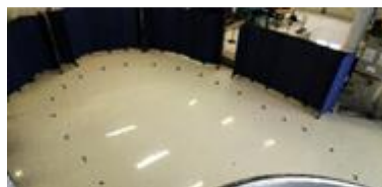
Figure 1: Walking path

Changes in DLPFC activation and improvement of walking performance are expected after the Sirocco program