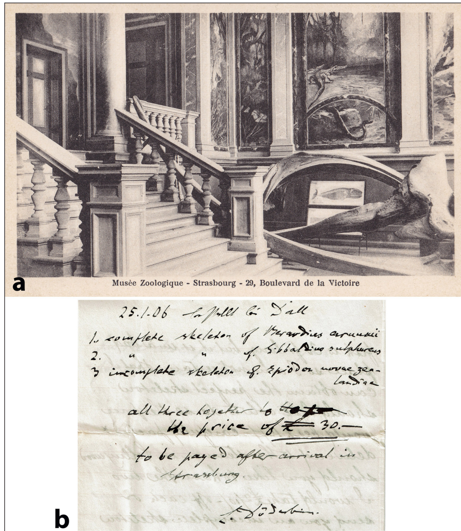
Figure 1: Old documents related to whale specimens at the MZS. (a) Post-card, probably from the beginning of the 20 th century (first published in 1923), showing the entrance hall of the museum. (b) Notes by Ludvig Döderlein at the back of a letter from James Dall dated Oct 8, 1905.

most of the German period. We found the letters which James Dall sent to Döderlein to organise the purchase and shipment of three whales, obviously those mentioned in the register, from New Zealand to Strasbourg via London. Dall owned a horticultural business in Nelson, New Zealand, and collected plants for sale, occasionally selling natural history specimens to European museums (S11). Döderlein notes at the back of one letter that the museum buys: “1. complete skeleton of Berardius arnuxii ; 2. complete skeleton of Sibbaldius sulphureus ; 3. incomplete skeleton of Epidon novaezealandiae . All three together to the price of £30.” (Figure 1b).