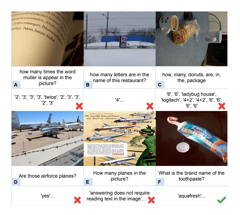
Fig. 1. Samples of triplets (Image, Question, List of answers given by 10 annotators) from TextVQA database for wrong (A-E) and correct (F) annotation cases for the problem of ST-VQA.

deep learning has been used with acceptable accuracy results of \approx 70\% for traditional VQA tasks, when solving the ST-VQA problem the accuracy drops to \approx 27\% demonstrating the challenge ahead. As a semantic description task, many related issues need to be addressed, we mention the most relevant ones. First, understand the type of question: although the task is well defined, current databases fail to define clean samples fitting the specifications of the task. Fig. 1 presents samples of triplets (Image, Question and Answers) from TextVQA database [13]. Each sample contains an image, a question associated and the ground truth list of answers given for 10 human annotators (for cases where the answers given by annotators are all the same, we put the unique answer, if the answers are different, we put the entire set of answers given by annotators). We present examples for wrong annotation cases (A-E) where there is no need to read the text in the image to answer the question or the answer given by the annotator is not correct (case C), the answer fall into the category 'Yes'/'No' (case D) or the case where the sample doesn't fit the requirements but it is possible to filter those samples by the answer given by the annotator (case E), and correct cases when the answer is as expected, some text present in the image required in the question (case F).