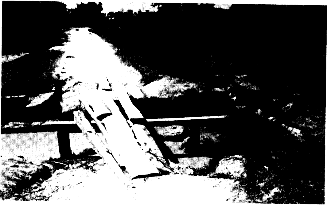
Photo. 1 Laterite canalisation passing through the south bank of the moat of Beng Mealea.