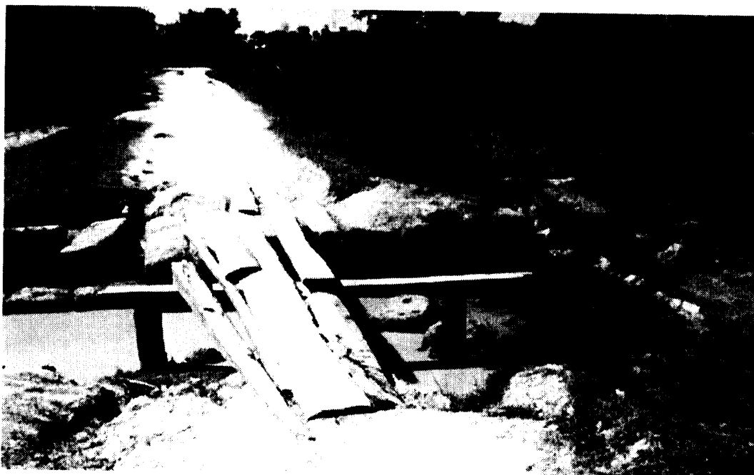
Photo. 1 Laterite canalisation passing through the south bank of the moat of Beng Mealea.