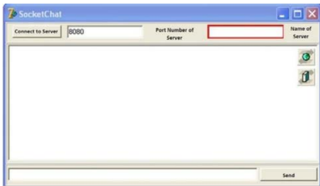
Fig. 4 The name of the server