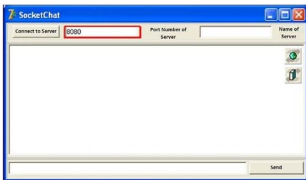
Fig. 3 The port number of the server