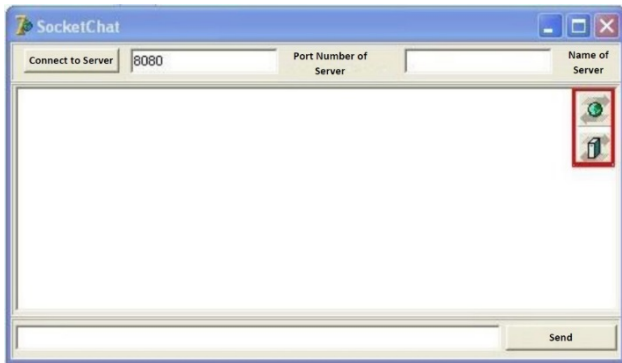
Fig. 2 The main dialogue box of the developed software

TObject;ClientSocket: TCustomIpClient;) Begin