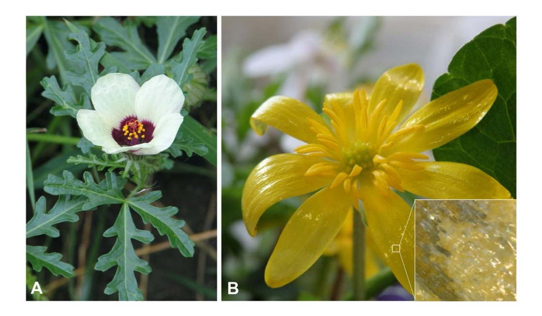
Figure 3 . Examples of flowers producing structural colours on their petals. A. The iridescent flower of Hibiscus trionum L. (Malvaceae). The dark zone on each petal has a striated epidermis that produces iridescence by light diffraction. B. The petals of Ficaria verna Huds. (Ranunculaceae) appear glossy because their very thin and flat upper epidermis, rich in pigment (close-up), reflects light in an effective way.