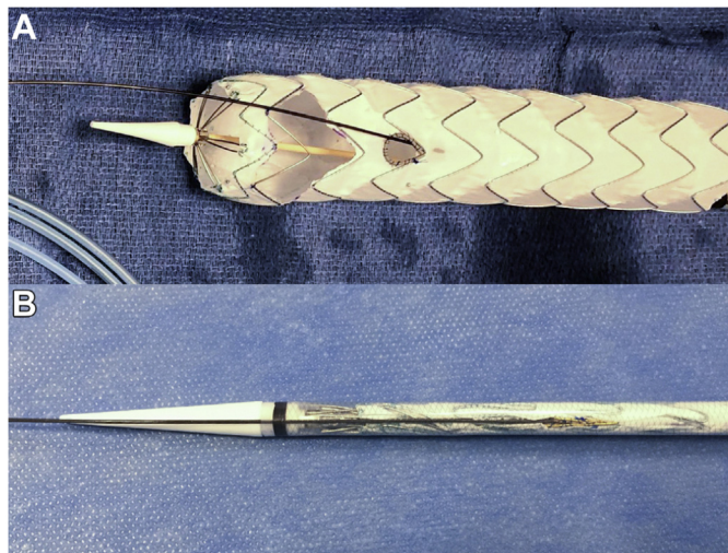
Fig 1. A. The unsheathed custom-made fenestrated Valiant Captivia thoracic stent-graft. The proximal large fenestration for the brachiocephalic trunk (BT) and left common carotid artery (LCCA) is constructed without removing the stent-graft stent struts. The site for the distal circular fenestration for the left subclavian artery (LSA) is selected such that it will not be crossed by any stent struts. A radiopaque marker is included to delineate the fenestration for the LSA under fluoroscopy. The hydrophilic guidewire is passed cephalad into the sheath through a needle hole and advanced through the stent-graft lumen, exiting through the LSA fenestration and continuing cephalad external to the stent-graft. B. Photograph of stent-graft when resheathed. The guidewire emerges from under the tip of the introducer sheath, in line with the LSA fenestration.

a chimney was used to manage the LSA. We believe that the misalignment was an error of deployment rather than a sizing or modification error. This was the third patient in our series. Two patients (4%) had experienced a stroke (visual loss and confusion; both with cerebral computed tomography changes). Both had had a full recovery by discharge, with no long-term deficits. The 30-day mortality was 2% (n = 1). This patient had died on day 4 after reintervention because of bleeding from the proximal anastomosis of the remnant iliac conduit. Four patients (8%) required reintervention. One was for a type IB endoleak, which was successfully treated by deployment of a distal thoracic stent-graft on the third postoperative day. The remaining three patients had required reintervention for access-related complications. Two patients (4%) had a type II endoleak from the LSA, both without sac expansion. The first was observed and had spontaneously disappeared by the third postoperative month. The second was still under observation at the last follow-up examination. Seven patients (14%) had presented with access-related complications. All supra-aortic trunks were patent, and no spinal cord ischemia, aortic rupture, perioperative myocardial infarction, retrograde dissection, or conversion to surgical