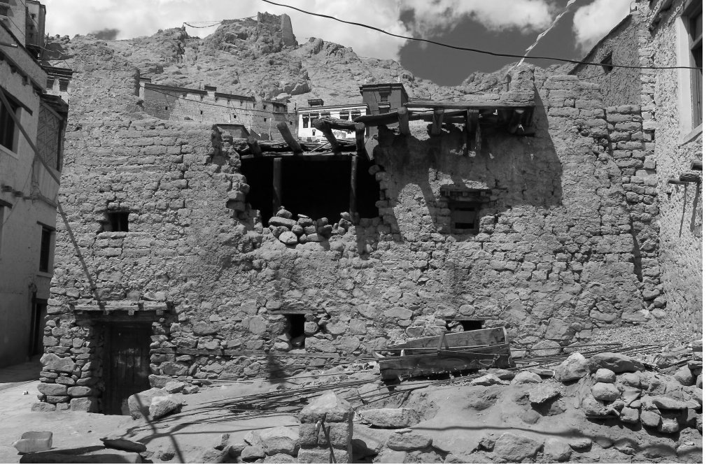
Figure 1. 'Manepa House' in Old Leh. Dollfus, 2017

Ladakhi manepa have never been wanderers, going from place to place all year around in accordance with religious festivals and the pilgrimage calendar. They used to have permanent residences and to own land which they cultivated. There was no ban on doing any kind of manual work for them. They could do all kinds of domestic chores, agricultural work, and other kinds of activities as all