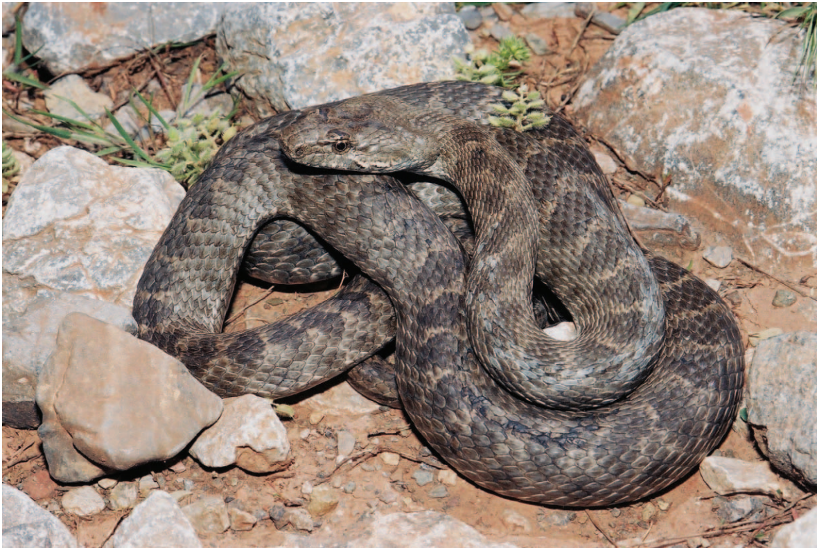
Hemorrhhois nummifer.