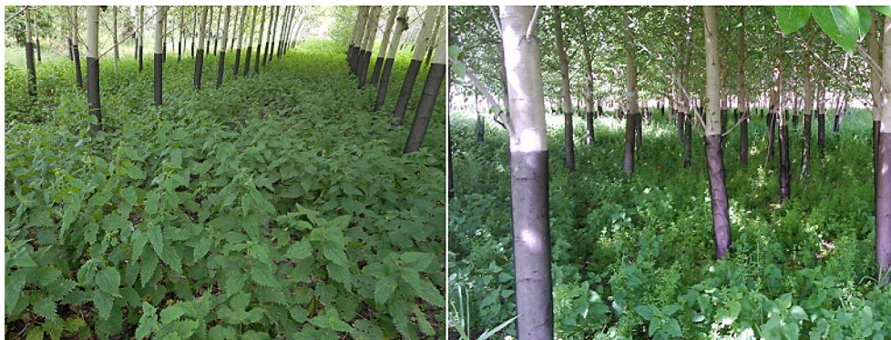
Fig. 1. Photographs of stinging nettle growing spontaneously and in a prevalent manner under short rotation coppice on metal-contaminated lands.