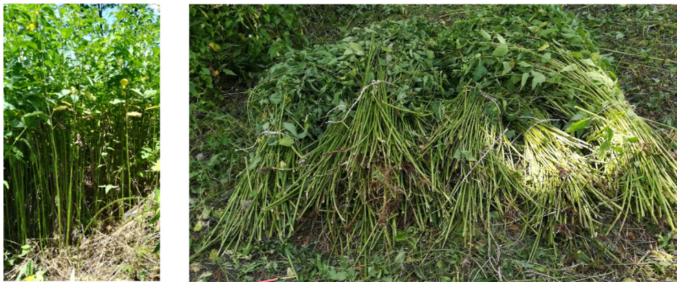
Fig. 2. Photographs of stinging nettle harvesting.

crops, such hemp, it was previously demonstrated that bast fibers and shives were not affected by TE contamination [5].