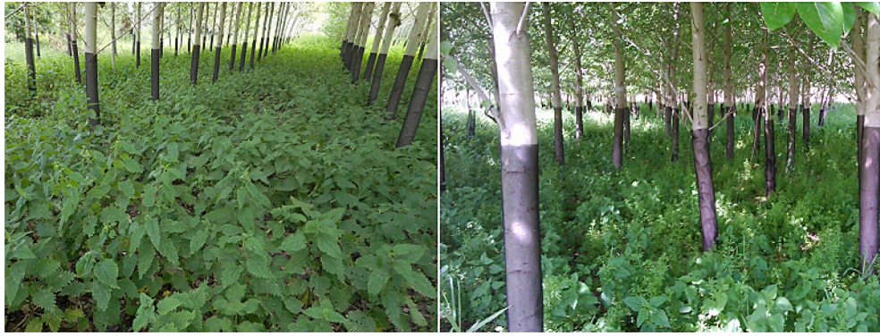
Fig. 1. Photographs of stinging nettle growing spontaneously and in a prevalent manner under short rotation coppice on metal-contaminated lands.