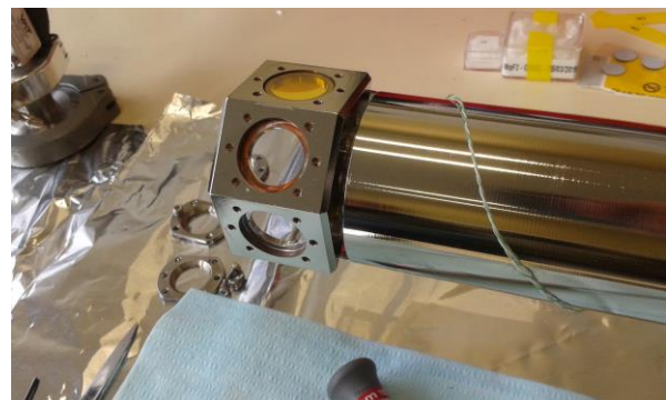
Figure 1 : Target windows holder of the IGLIAS set-up. The isotopic labeled gases are condensed at 8K on each window prior to irradiation. ZnSe IR-transparent windows (yellow window covered with a brown residue) are used, allowing IR spectroscopy monitoring during the irradiation.

determined from the interference fringe patterns on the IR spectra taken in situ [7, 9]. In the first experiment (hereafter referred as sandwich Sd#1) the isotopically labeled central ice layer was 15 N 2 -CD 4 (90:10). In the second experiment (sandwich Sd#2) the central isotopically labeled layer was 15 N 2 -CD 4 - 13 CO (80:10:10).