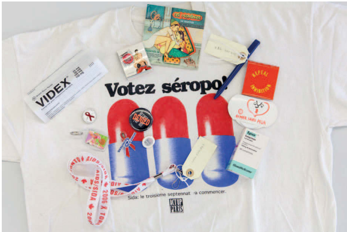
Sample of objects from the “collection bis.”

hospital sector, the public health sector, or the private sector. It is also a question of establishing common benchmarks within the community committee on how these issues have been dealt with in other contexts, under different skies, and by other institutions and professions.