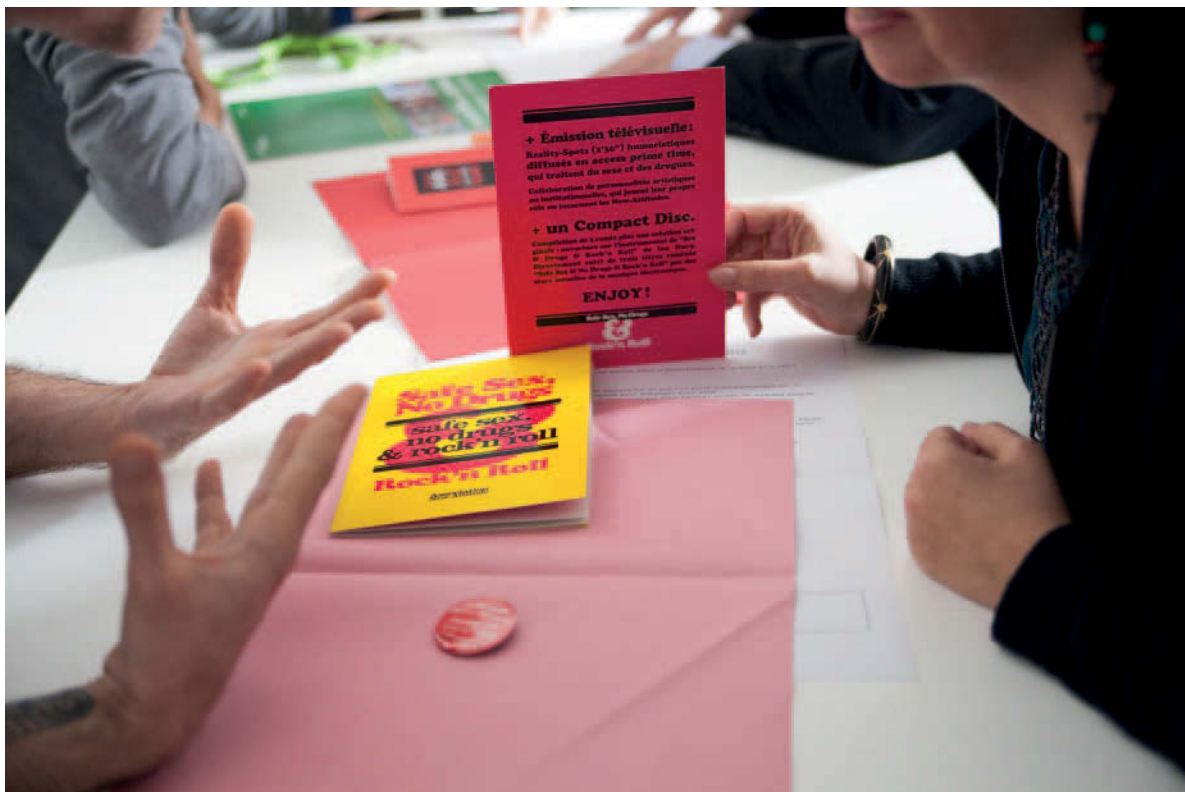
Workshop around “collection bis” during a study day.

Following the valorization project, a series of study days were organized to shed light on various aspects of the memory, museum, and exhibition of the fight against the HIV/AIDS epidemic. It is both a theoretical foundation and a repertoire of practices, which are also intended to bring together the views and knowledge of different actors, whether they are French or foreign museum professionals (curators), academics from different disciplines (anthropology, sociology, history, art history, epidemiology, public health), or a diversity of actors coming from the social and associative fields, the