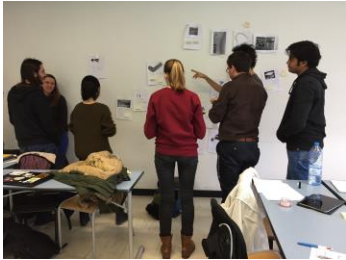
Figure 1: Idea collection of deformable objects in daily life, during a workshop facilitated by authors for Master students.