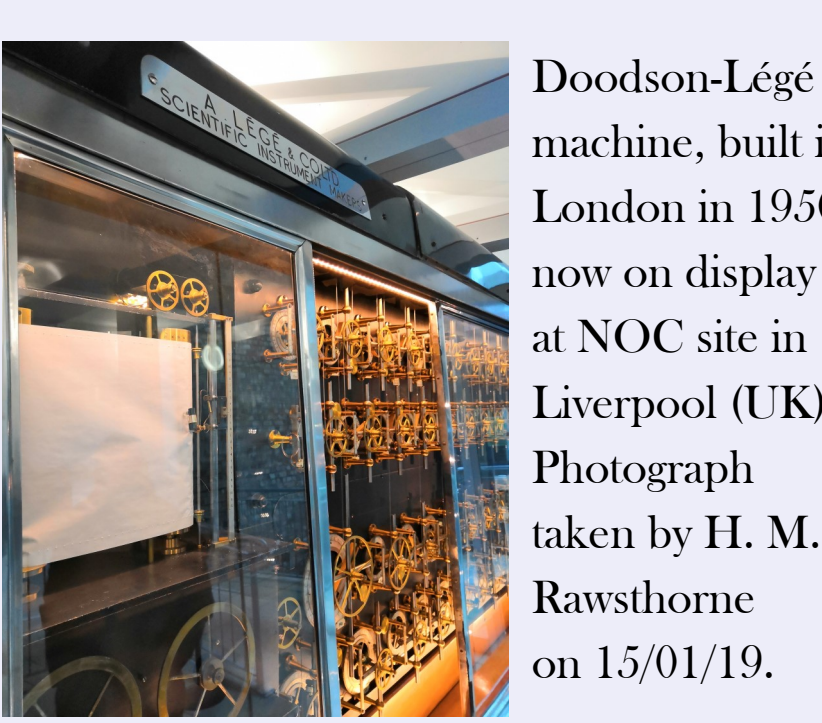
Doodson-Légé machine, built in London in 1950, now on display at NOC site in Liverpool (UK). Photograph