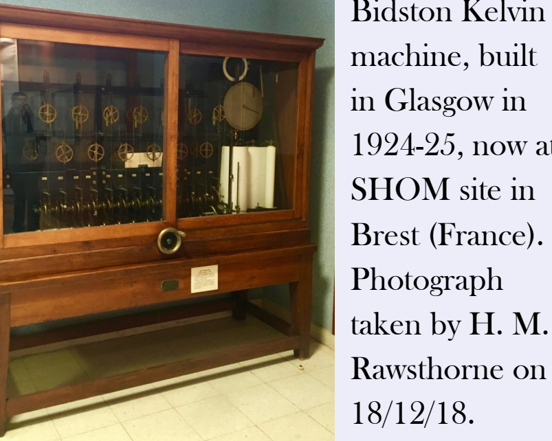
Bidston Kelvin machine, built in Glasgow in 1924-25, now at SHOM site in Brest (France). Photograph