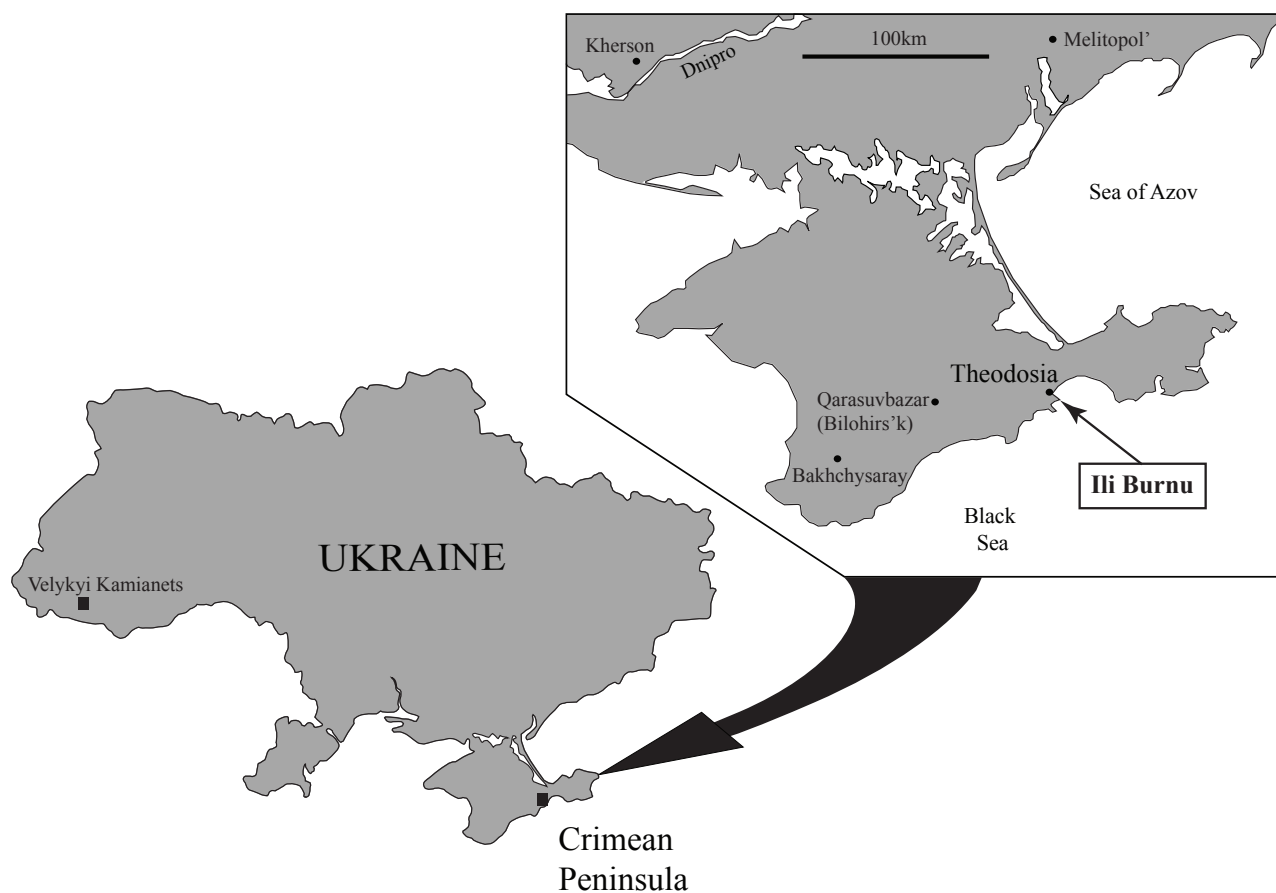
Fig. 1. Locality map of sites mentioned in the text.

In 2018, our team published an account of the uppermost Jurassic to lowest Cretaceous rocks of eastern Crimea – that crop out in the cliffs at the eastern extremity of the hill mass of Tepe Oba, around the headland of Ili Burnu. That publication was then commented upon by Arkadiev et al. (2019). We are at something of disadvantage in discussing local lithostratigraphy in reply, because whereas we have tried to present carefully measured representations of the accessible stratigraphic sections at Theodosia (Bakhmutov et al. 2018, figs. 2 and 3), Arkadiev et al. (e.g. 2019, fig. 2; and earlier papers by the same authors, cited herein) promote synthetic and composite diagrams. It is not possible to compare measured logs of tangible rock sequences, an accurate lithostratigraphy, with stylised diagrams and estimated thicknesses. Earlier, Bakhmutov et al. (2018) referred to problems encountered when trying to make comparisons with published Russian accounts, where it was apparent that the thicknesses given were less than accurate.