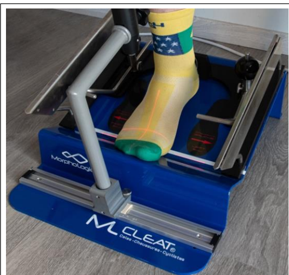
Figure 1: Measurement of the length between the first metatarsal head and the heel of the cyclist using ML Cleat® in order to optimise the cycling cleat position.

Postural System® (Morphologies, Saint-Malo, France) and the feeling of the cyclists.