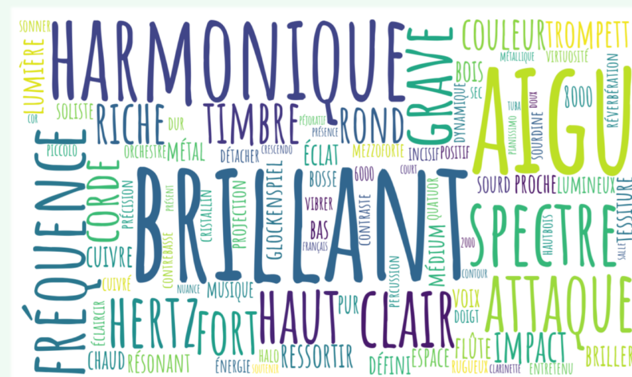
Ex : Bright (Brillant)