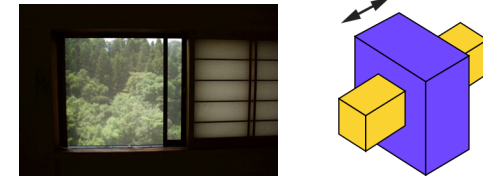
Figure 3. Example of changing porosity/permeability. Sliding window (left) and prismatic low pair (right).

to implement changing Porosity [9] or Permeability [11] other than the revolute pair that was used in Shutters [1]; a ventilation window (#17) can open holes through a prismatic pair (sliding, Figure 3).