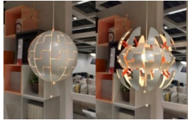
Openable lamps (#18) change lamp shadows to change light quality