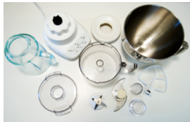
Blender (#36) can change the blades and containers according to the purpose.