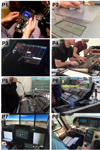
Figure 1. Participants using knobs and sliders in their professional activity: (P1) a cameraman with 4 knobs and a slider on a custom made device; (P2) a graphic designer using a graphic tablet and a slider placeholder; (P3) a light artist using custom knobs and sliders on a tablet in a dark environment; (P4) a light engineer using physical knobs and sliders while observing a stage; (P5) a sound engineer communicating with musicians on the far stage while using sliders; (P6) a sound engineer controlling a knob while watching a screen; (P7) a pilot using flight simulator for his training; (P8) a pilot using physical controls in a flight.

interest in creating those objects, and HCI researchers can empower Makers by 1) defining user needs on reconfigurable objects/interfaces, 2) refining design frameworks for creating new ideas, and 3) implementing prototyping knowledge and tools to accelerate and ease fabrication process.