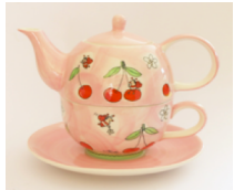
Tea pots and cups (#48) are combined to store, and detached to drink tea

Figure 2. Examples of collected everyday reconfigurable objects. The full collection of 82 objects with pictures is available at [24].