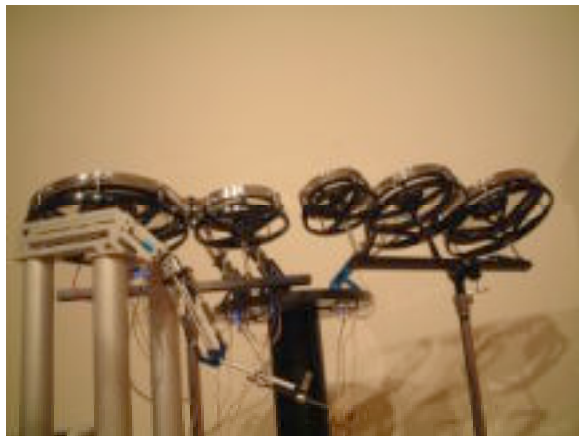
Fig.5: There is a special sort of springs in the arm of the robot. At the end of this, it holds a mallet.

The robot has a special sort of springs to imitate a human muscle. Each holds a mallet at the end of his arm (Fig.5).