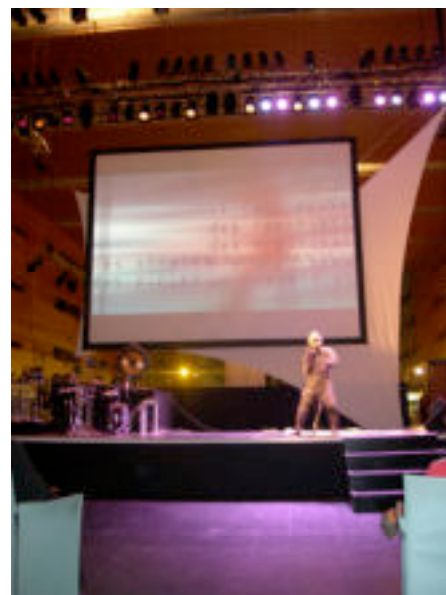
Fig.1: A performance with "BodySuit" and "RoboticMusic". A photo from its rehearsal.

This project originally started in 2002. This system is intensively experimented with and was shown on several occasions during 2005. The last performance was realized in, "Utopiales," a festival in Nantes, France in November, 2005 (Fig:1).