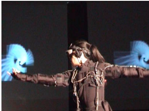
Fig.2: BodySuit can also control sounds and video images in real time.

"BodySuit" was first created by an electronic engineer Patrice Pierrot, in 1997. Although it was originally conceived to work with "RoboticMusic," it had to wait many years until "RoboticMusic" was ready. Meanwhile, many possibilities of "BodySuit" were explored, for instance, it was experimented with to control computer generated sounds and video images (Fig. 2).