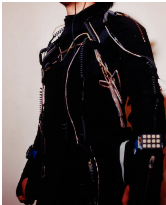
Fig.6: Upper half of body with BodySuit. The 12 bending sensors are placed on each joint of body.

A performer wears this suit, but doesn't hold a controller or any instruments in his hands (Fig.6).