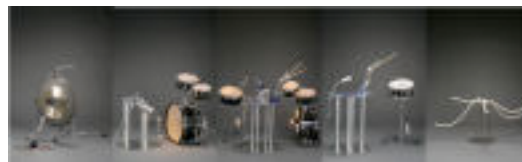
Fig.3: RoboticMusic. From the left to right, Gong, Bass Drum, Tom-toms, Snare, Pipes.

RoboticMusic contains 5 robots (Fig.3), which play percussion instruments, such as a Gong, Bass Drum, Snare Drum, Tom-Tom, or Cymbal. These instruments can be replaced as long as the replacement instruments can be played with Mallets (Fig.3).