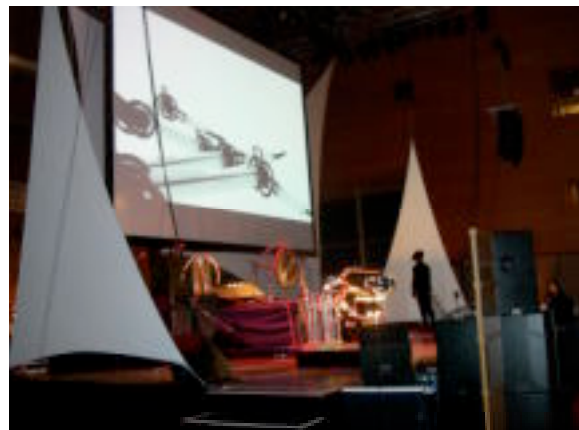
Fig.8: This system is applied to a music theater work. There is a 3D image (by Yann Bertrand) behind RoboticMusic.

This system was applied to a performance/musical theater work in a composition (Fig.8).