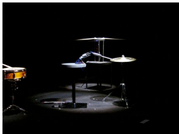
Fig.4: Pipe Robot appears behind the Cymbal Robot on this photo. Pipe robot changes the pitches according to the speed of spins.

One of robots plays numerous pipes, and rapidly spins to create Flute-like sounds, which are generated while the air goes through them. These pipes are different lengths according to the pitches one desires. As it spins faster, the pitches become higher as following an overtone series (Fig.4).