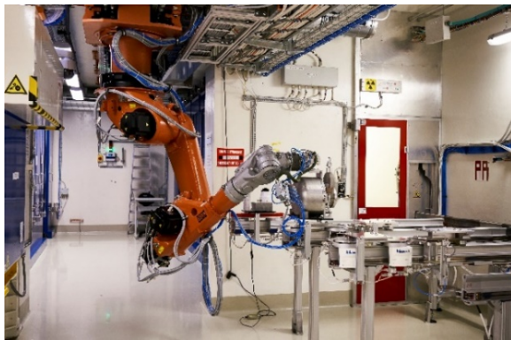
Figure 4: KUKA® robot manipulating a MEDICIS target placed on the rail conveyor system (RCS).

ISOLDE target, the beam is directly stopped in the beam dump. The MEDICIS target takes advantage of these unused protons without impacting the physics program at ISOLDE and acts as a parasitic facility.