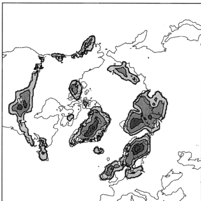
Figure 1. Map of the steady state obtained with the ISM for the LGM climate, with temperatures and precipitations reconstructed from LMD4.3 (prescribed SST). Ice elevation is in kilometres.

Jensen et al, 1993] and comparing it with simulated LGM values, there is also an overestimation of precipitation in the LMD AGCM: the corrected values used in the ISM seem then more realistic. Therefore in the direct approach, the accumulation is overestimated due to heavy precipitation, and the mass balance of the ice sheet is obtained because there is an equilibrium between important accumulation and ablation. The ablation reaches also high values because the summer temperatures for LMD4.3 are positive, leading to melting (cf table 1). On the other hand, in the coupled method, the ablation is similar but the accumulation is strongly reduced, which leads to a collapse of both ice sheets. However, these results must be taken with caution, because they may depend on the way ablation is parameterized in the ISM (empirical parameterization on present day values for the snow and ice melting coefficients). The lapse rate coefficient used to correct surface temperatures ( 8^\circ/\text{km} ) is empirical too. The sensitivity to the lapse rate values may slightly modify the results. In conclusion, the one way coupled method is more adequate to evaluate LGM ice sheets equilibrium. In other experiments, we will therefore focus only on the results of the coupled approach.