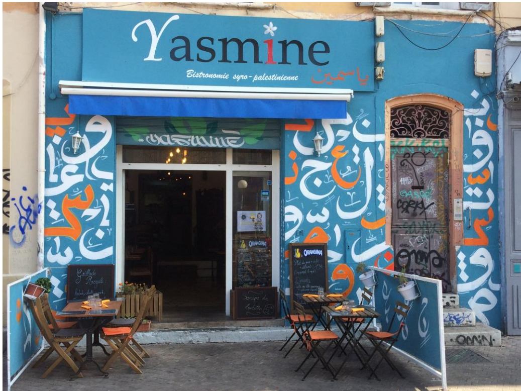
Picture 1: Palestinian-Syrian restaurant Yasmine in Marseilles

Palestinian-Syrian refugee family from Yarmouk Palestinian camp (Damascus) has opened three pubs and restaurants since 2012. Their newest one is named Yasmine and has become, in a very short time, a trendy and busy place (Picture 1). Many Syrians had participated in the opening party, including Yasser who enjoys this place managed by like-minded opponents to the Assad regime. It is for the access to these social opportunities that Yasser appreciates the possibility to settle in an area close to the city centre.