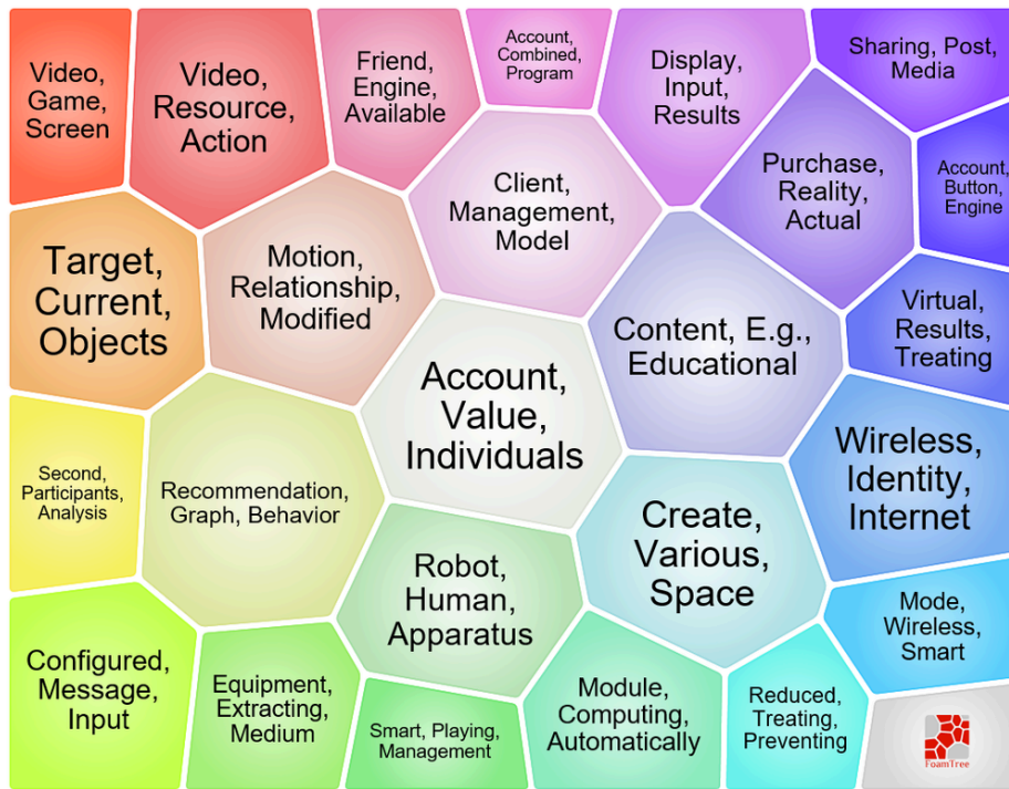
Figure 3. The patent abstract classes created using carrot2 software, k-mean algorithm, 25 classes. Showing quite clearly the main components of social interactions in the technological point of view.