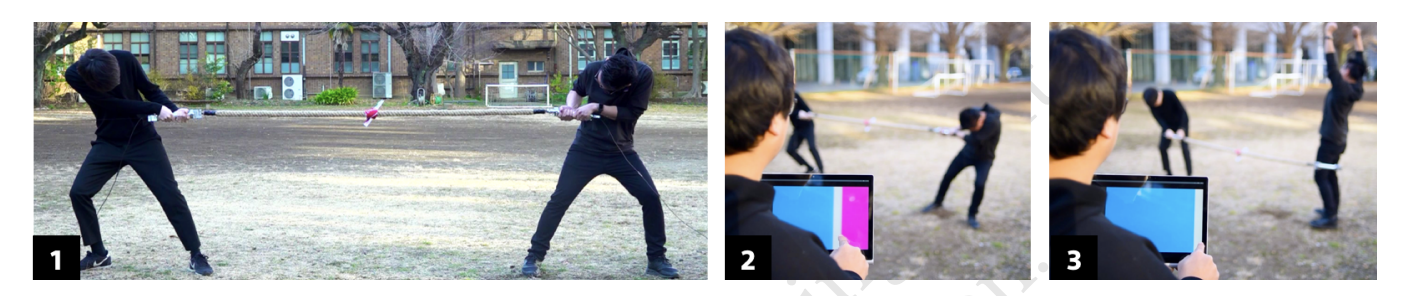
Figure 1: 1) A tug of war fight by two players began. 2) However, another person (as 'mediator') is controlling the game without noticed by the players. 3) The players were totally engaged with the game since they believed to play a tight game.

Masahiko Inami<sup>†</sup> inami@star.rcast.u-tokyo.ac.jp