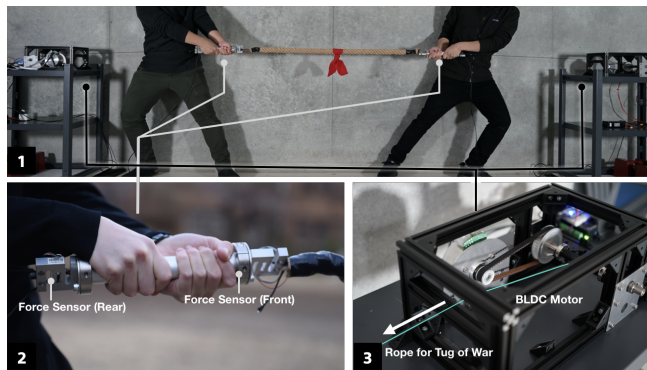
Figure 2: 1) The players are pulling the handles with the rope. 2) Two force sensors with the handle measure forces at both front and rear sides, which detects how each side of player(s) is putting force. 3) A BLDC motor is also pulling the rope.

players pulls the tug and believe that they are having a tight game. But, the system or even another person enables to mediate the game while the players will not recognize the physical interventions.