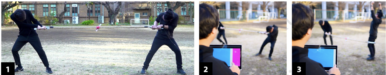
Figure 1: 1) A tug of war fight by two players began. 2) However, another person (as ‘mediator’) is controlling the game without noticed by the players. 3) The players were totally engaged with the game since they believed to play a tight game.

Masahiko Inami † inami@star.rcast.u-tokyo.ac.jp