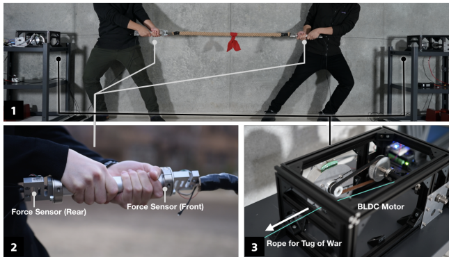
Figure 2: 1) The players are pulling the handles with the rope. 2) Two force sensors with the handle measure forces at both front and rear sides, which detects how each side of player(s) is putting force. 3) A BLDC motor is also pulling the rope.

players pulls the tug and believe that they are having a tight game. But, the system or even another person enables to mediate the game while the players will not recognize the physical interventions.