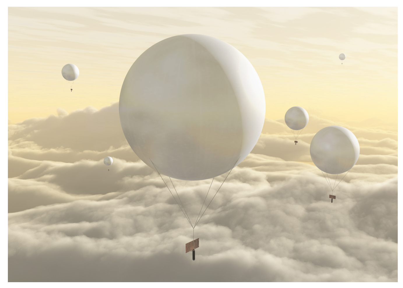
Figure 1. Artist's impression of the balloon fleet in the upper "clear zone" at \sim 50 km above the surface of Venus

for the Category 2 probe, which is nearly an order of magnitude higher than the Category 1 probes.