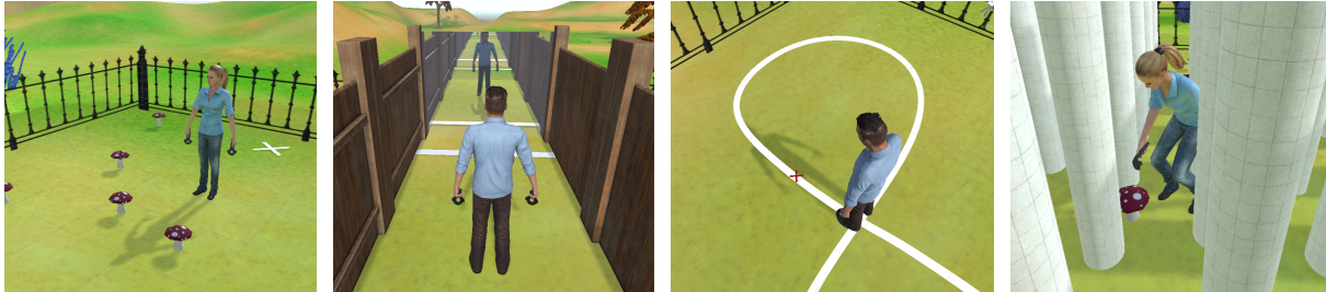
Figure 1: Illustration of the four tasks performed by the participants in our user study, all in the full-body avatar condition. The same tasks were also performed without an avatar. From left to right: Training task, Corridor task, Path-following task and Columns task.