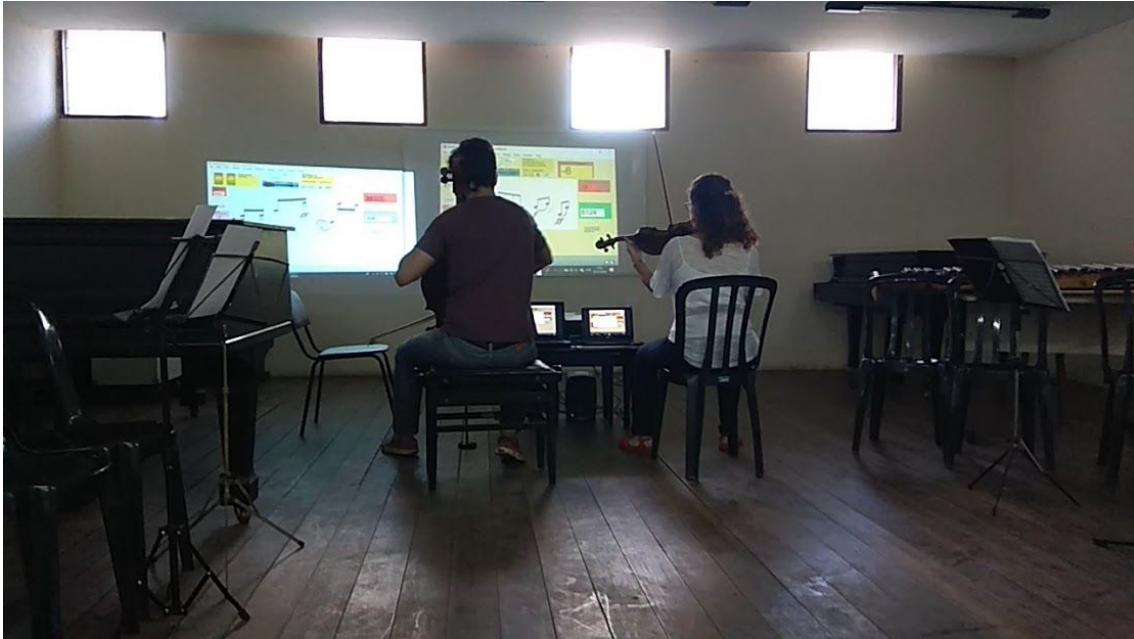
Figure 2. Ntrallazzu 5 , performed at the Universidade Federal da Paraíba