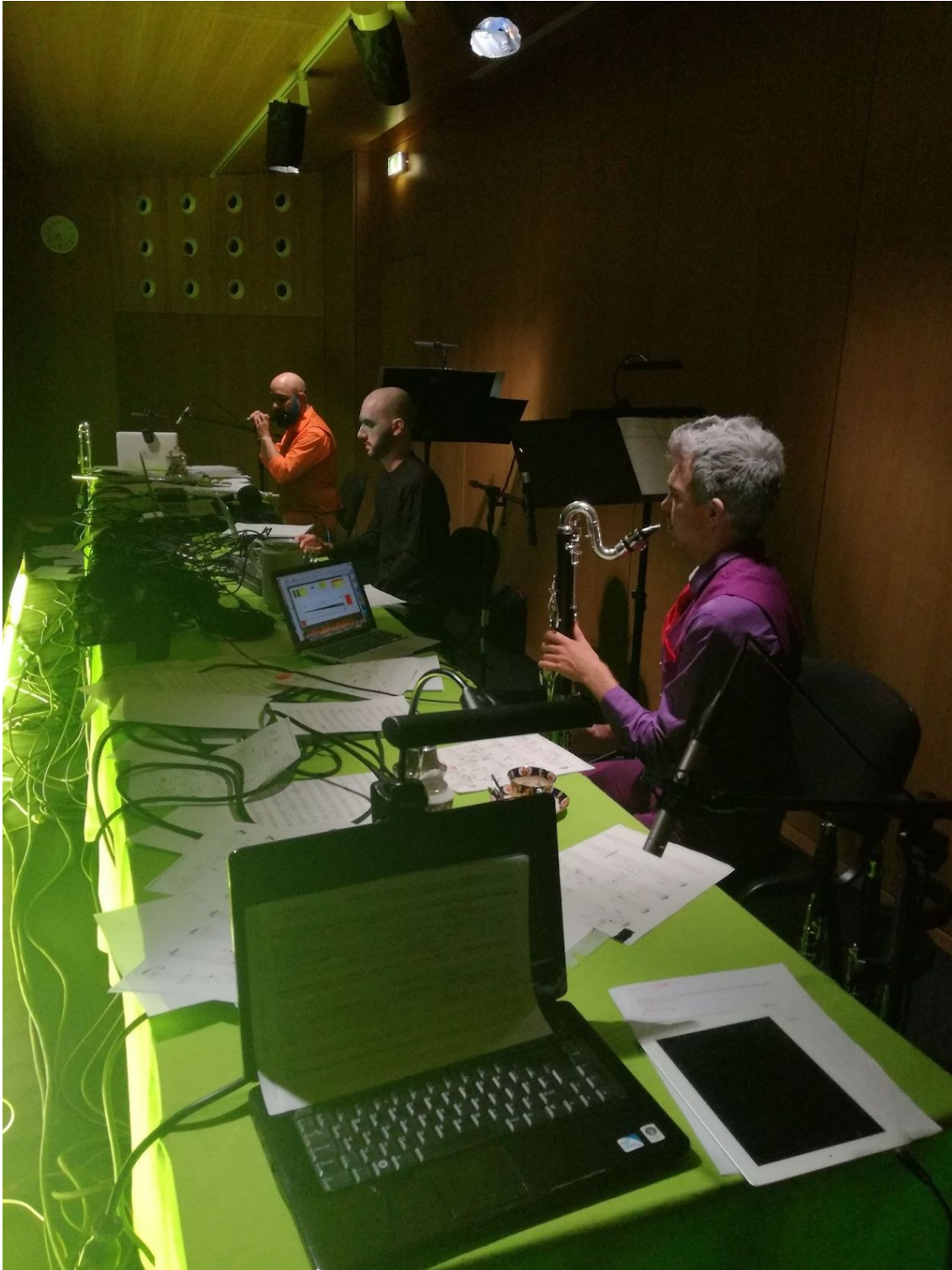
Figure 1: Ntrallazzu 1 in Strasbourg, France, June 2018.

The pieces that compose the cycle Ntrallazzu were composed between 2013 and 2018. The first piece was written and developed between 2013 and 2014, and called for an instrument of the flute family, plus one of the clarinet family. This first version of