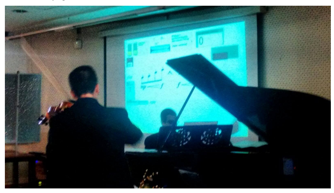
Figure 2. the score being projected during the premiere of Ntrallazzu 2 , in Lisbon, May 2018.

formulating opinions on the general dynamics of what is going on. An important element, in this sense, was the projection of the score to the audience (Fig. 2), which was not always possible.