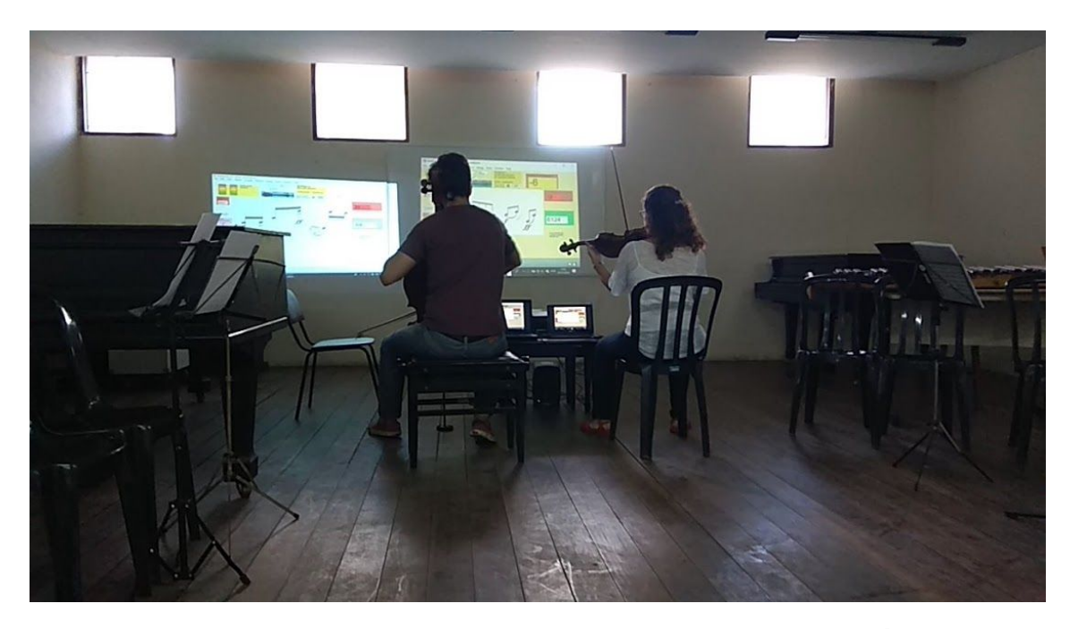
Figure 2. Ntrallazzu 5, performed at the Universidade Federal da Paraíba