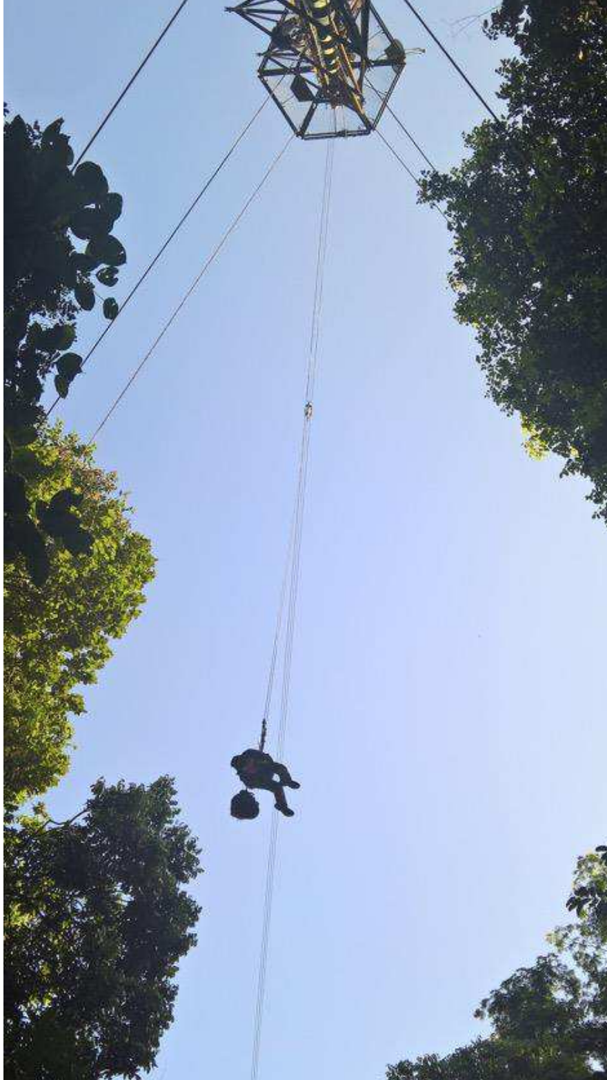
Figure 1: The Canopy Operational Permanent Access (COPAS) system, allowing access for unrestricted access to the upper canopy. This was used to sample leaves from which endophyte communities were extracted.