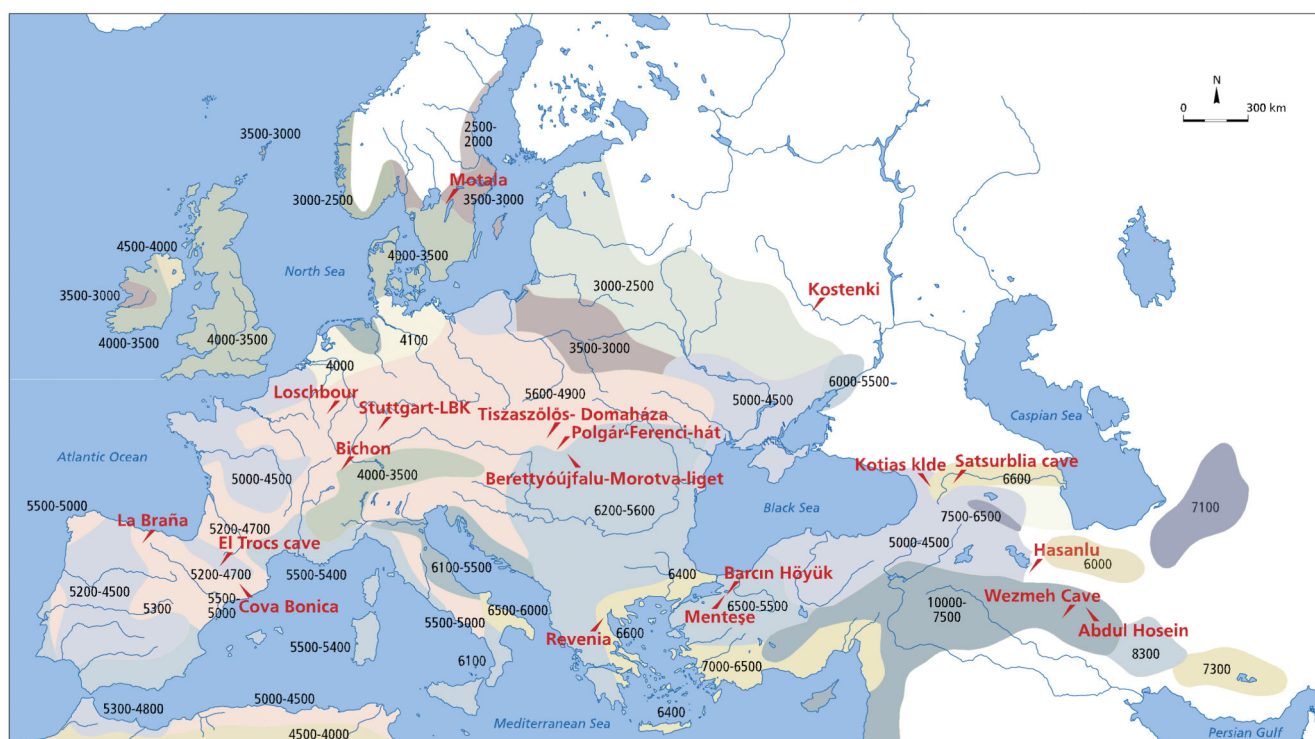
Fig 1. Map of prehistoric Neolithic and Iron Age Zagros genome locations.

Colors indicate isochrones with numbers giving approximate arrival times of the Neolithic culture in years BCE.