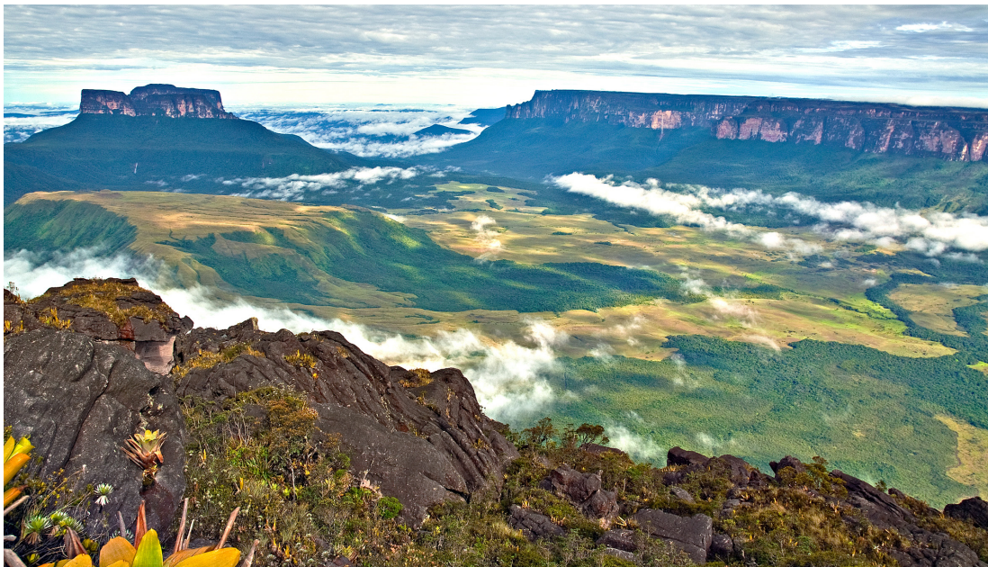
Fig. 2. Typical Pantepui landscape. Photograph taken on 8 th June 2012 from the summit of Upuigma-tepui, showing Angasima-tepui on the left and Akopán-tepui and Amurí-tepui on the right. Note stretches of savannah mainly caused by anthropogenic fires.

cies from west of the Río Caroní: S. riae ; in total 16 novel sequences), and with Fritziana ohausi , member of the clade sister to Stefania (Castroviejo et al. 2015), which was selected as outgroup (see Table 1). Novel sequences have been catalogued in GenBank under the accession numbers KU958582-958637.