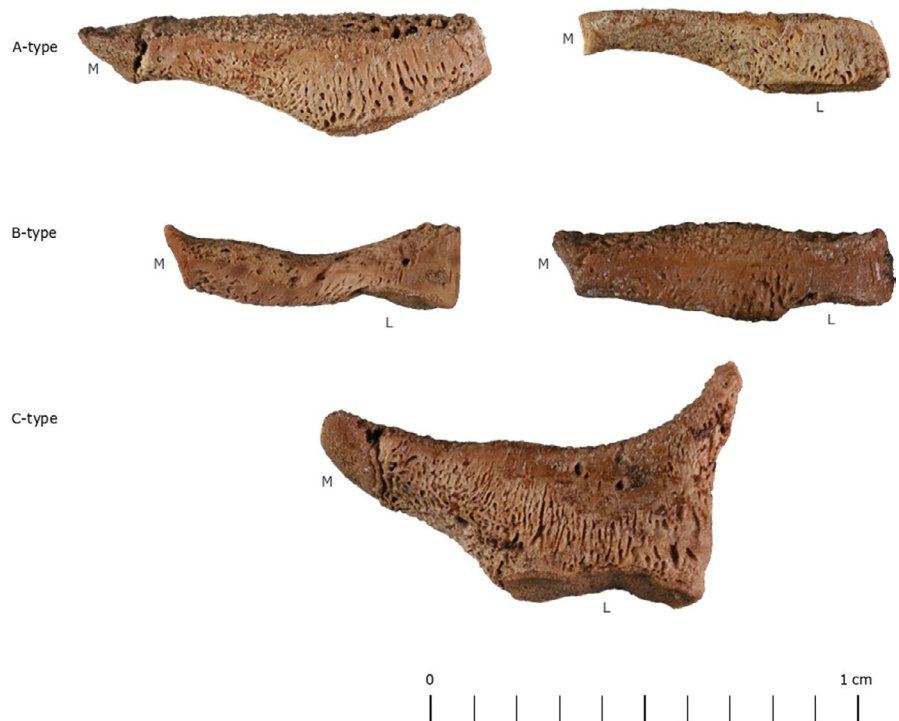
FIGURE 6 Morphological variability of cervical ribs in early life: classification proposition. Superior view. L, lateral articular surface; M, medial articular surface. A-type: right cervical rib of the individual S11 and cervical rib of the individual S9. B-type: cervical ribs of the individual S70 and the individual S39. C-type: left cervical rib of the individual S11

According to our results, the frequencies of cervical ribs in the archaeological corpus are extremely high compared to those observed in contemporary adult populations (Table 1). This discrepancy can be investigated through several hypotheses. The first hypothesis (H1) is that the frequencies of the variant observed in adulthood would be lower because the cervical ribs would in most cases fuse during childhood with the transverse process of the vertebral hemiarch. The second hypothesis (H2) is based on a presumed genetic origin and heritability of the variation (Barnes, 1994). If it was a