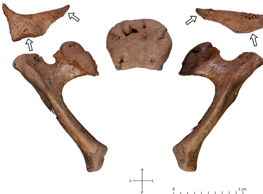
FIGURE 5 Repositioning with orientation of the cervical rib in relation to the vertebral hemi-arches and the vertebral centrum, example of the individual S11. Arrows, articular surfaces; A, anterior; L, lateral; P, posterior

Abbreviations: N, number of individuals in each age group; NB, number of individuals with bilateral ribs; NU, number of individuals with unilateral ribs; NUL, number of individuals with unilateral left rib; NUR, number of individuals with unilateral right rib; NUU, number of individuals with unilateral ribs of undetermined side.