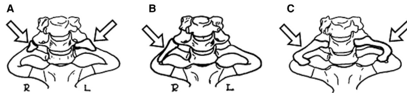
FIGURE 1 Morphological types of adult cervical ribs usually distinguished based on clinical studies. (A) 'rudimentary' or 'atrophied' type, (B) 'phalanx-like' type, (C) 'rib-shaped' type, modified after Patterson (1940, pp. 534–535, figures 4, 6 and 21)